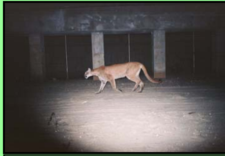
Female panther using a wildlife crossing.

Florida Fish & Wildlife Conservation Commission Panther team and Panther Tracker, Roy McBride, asked the Florida Panther Posse to place a motion camera under the Corkscrew Road/Alico Wildlife underpass to monitor Florida panthers. The Posse was successful with the above photo of an uncollared female Florida panther using the wildlife underpass.